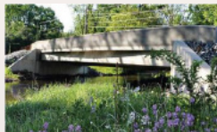
PA Rapid Bridge Replacement $899M