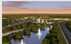
I-4 Express Lanes $2,000M