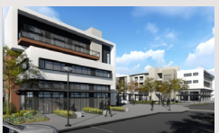
UT Dallas $67M