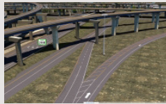
SH 288 Toll Lanes $1,000M