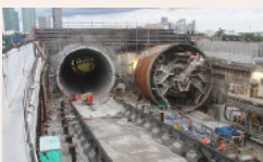
PortMiami Tunnel $1,000M