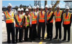
I-595 Express $1,800M