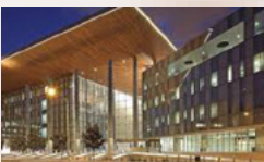
Long Beach Courthouse $495M