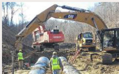
Ohio River Bridges $750M