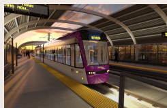
Maryland Purple Line $3,000M