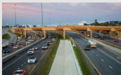
North Tarrant Express $2,000M