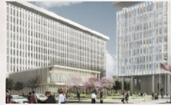
Long Beach Civic Center $513M