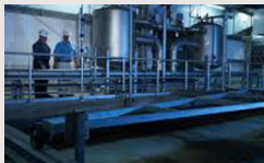
Bayonne Municipal Water $170M