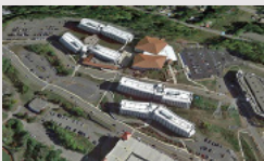
Montclair State University $200M