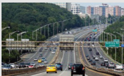
I-95 HOT Lanes – Capital Beltway $2,000M