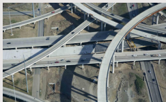
IH 635 Managed Lanes – LBJ Express $2,600M