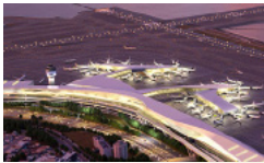
LaGuardia Airport Central Terminal $4,000M