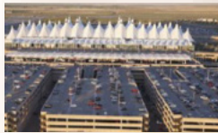
Denver Intl Airport – Great Hall $1,000M