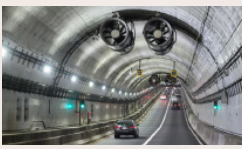
Elizabeth River Crossing $2,000M