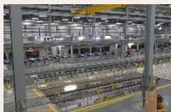
Denver Eagle RTD $2,000M