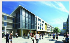
University of California, Merced $1,100M