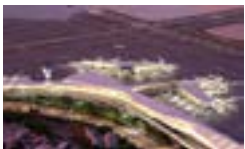
LaGuardia Airport Central Terminal $4,000M