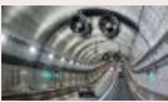
Elizabeth River Crossing $2,000M