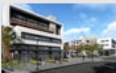
UT Dallas $67M