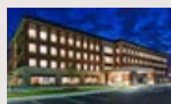
Texas A&M Student Housing $356M