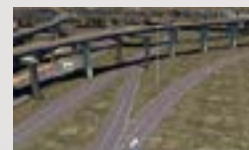
SH 288 Toll Lanes $1,000M