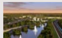
I-4 Express Lanes $2,000M