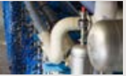
Carlsbad Desalination $1,000M