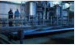
Bayonne Municipal Water $170M