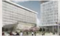
Long Beach Civic Center $513M