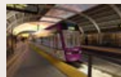
Maryland Purple Line $3,000M