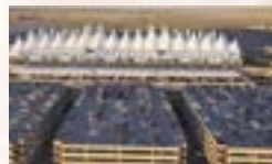
Denver Intl Airport – Great Hall $1,000M