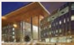
Long Beach Courthouse $495M