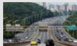
I-95 HOT Lanes – Capital Beltway $2,000M