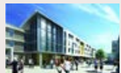
University of California, Merced $1,100M