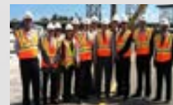
I-595 Express $1,800M