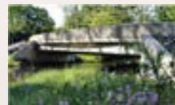
PA Rapid Bridge Replacement $899M