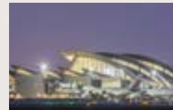
LAX People Mover $2,000M