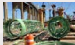
Goethals Bridge $1,500M