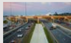
North Tarrant Express $2,000M