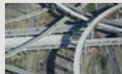
IH 635 Managed Lanes – LBJ Express $2,600M