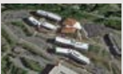
Montclair State University $200M