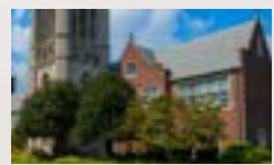
Jersey City University $40M