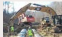
Ohio River Bridges $750M